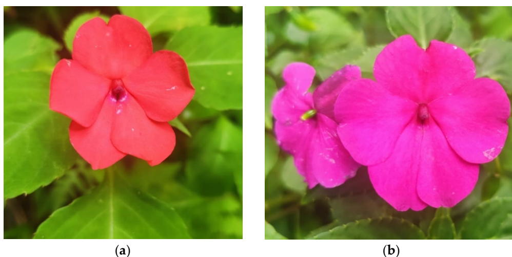
Figure 1. Flower specimens of the Impatiens walleriana studied. (a): orange petals and (b): pink petals.

To date, there is no study in the literature on the colourimetry of flowers of I. walleriana . However, [16] stated, by chromatography, that the flowers of I. balsamina L. may present greater homogeneity of pigments than its stems and sepals. [17] analysed, by spectrophotometry, the pink and orange varieties of flowers of the species I. walleriana and I. hawkeri W.Bull, which allowed them to state that the anthocyanin content may vary according to the species or part of the plant under study.