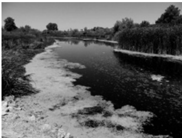
Figure 2: The Nadel Canal (Starčevo locality) – typical habitat of A. aquaticus in Serbia.

Although in investigated area other representatives of asellids, such is genus Proasellus , could be present, in this investigation their presence was not confirmed. Morphologically all found specimens were more or less uniform, and belong to type species A. aquaticus (Figure 3).