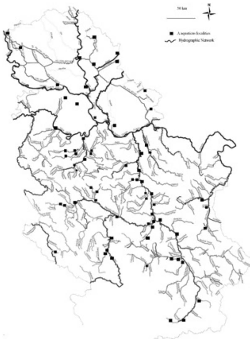
Figure 1: Localities where Asellus aquaticus was found during 2007-2013 period in Serbia.