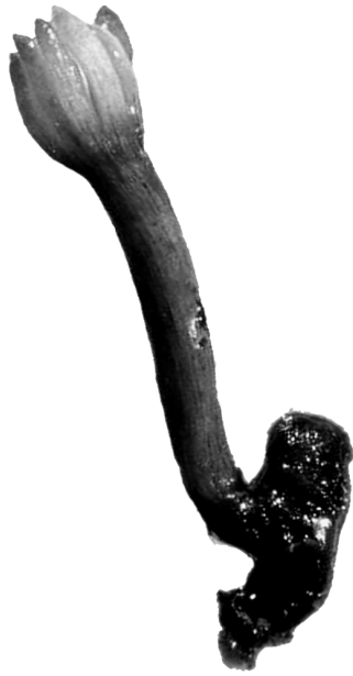
Fig. 2. Germinated embryo of Pinus heldreichii grown on medium without salts and vitamins (0GD).