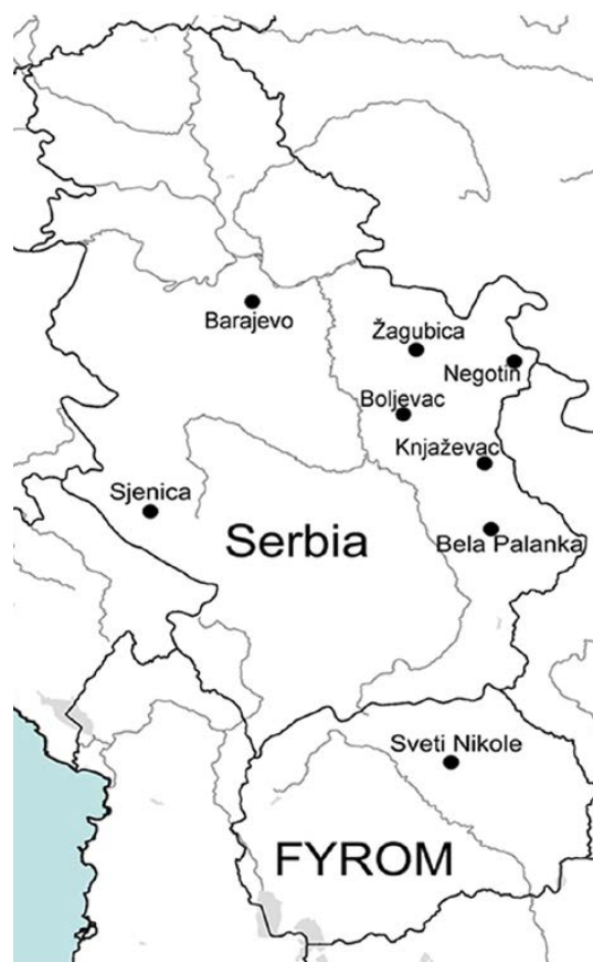
Figure 1. Map with localities in Serbia and Former Yugoslav Republic of Macedonia where wolves were hunted during 2009-2011.