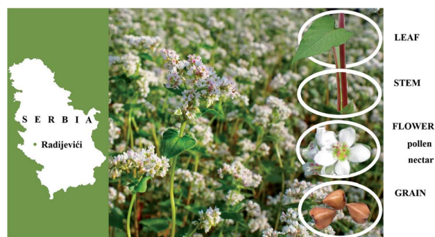
Fig. 1 Buckwheat samples (leaf, stem, flower, grain, pollen, nectar) collected in Serbia, Nova Varoš, Radijevići (43°23'31" N; 19°52'20" E).

All samples were taken from the buckwheat plant ( Fagopyrum esculentum Moench) species ‘Novosadska’ cultivated in a small locality in Western Serbia, in a village Radijevići (43°23'31" N, 19°52'20" E) (Fig. 1). Samples were harvested at the flowering season of buckwheat during the full nectar secretion, in July 2017. Buckwheat plant organs such as leaf, stem, flower, and