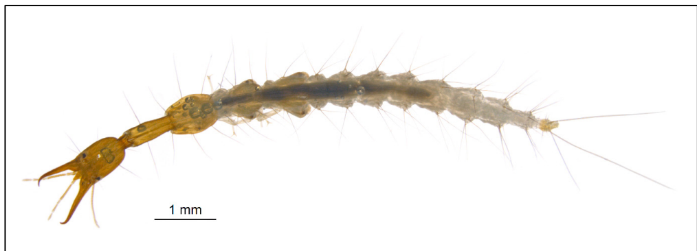
Figure 2. Nevrorthus apatelios , larva from the Neretva gravel bar at Cerova, dorsal view.

Slika 2. Nevrorthus apatelios , ličinka iz prodišča na Neretvi pri Cerovi, dorzalni pogled.