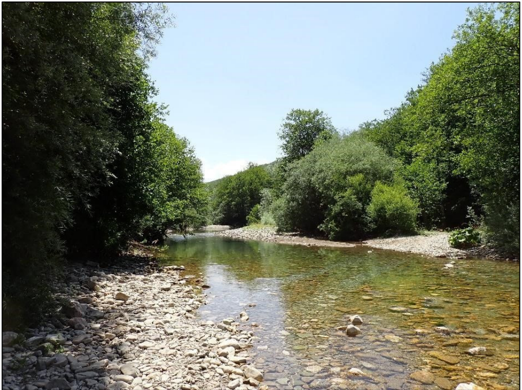
Figure 3. One new locality of N. apatelios on the Neretva River at Cerova (Loc. 2, Fig. 1, Tab. 1), with gravel bars and surrounding forests.

The habitat where Nevrorthidae larvae are found is limited to perennial, oxygen rich and clean water systems with gravel in various forms, larger blocks and coarse sand in non-urbanised areas with intact natural vegetation such as maquis, montane forests, or deciduous forests, usually in coastal mountain ranges (Zwick 1967; New 1978; Aspöck & Aspöck 1983; Malicky 1984; Letardi et al. 2005; Jones & Devetak 2009; Gavira et al. 2012; Monserrat & Gavira 2014). The two locations on the Neretva River fit this description – both are situated in the natural river course, surrounded by the well-preserved natural riparian and deciduous forests, with almost no human settlements (Fig. 3). The Nevrorthidae are tolerant towards wide ranges of water temperatures, but sensitive to pollution, so they can be regarded as indicators of clean water (Malicky 1984). Their presence in the upper Neretva part supports the pristine and non-polluted nature of this part of the river.