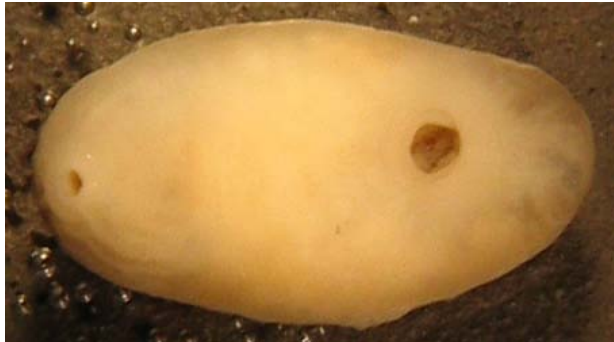
Fig. 1. Stichorchis subtriquetrus – ventral view.