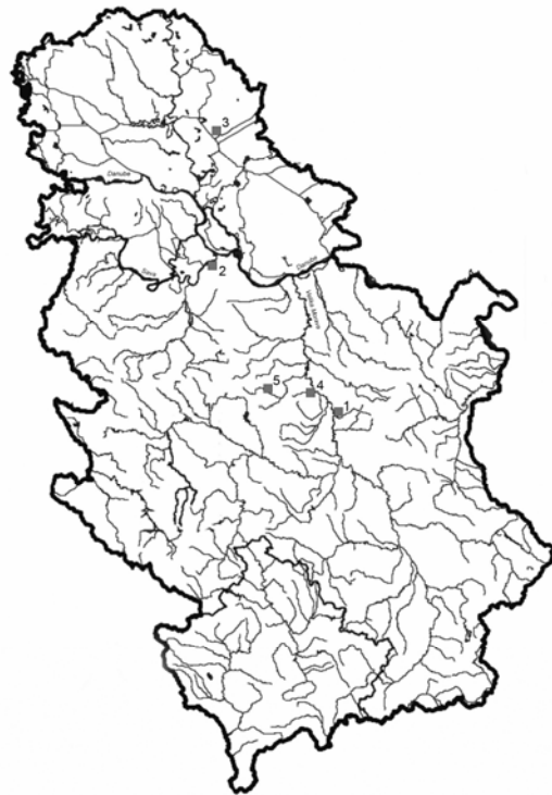
Figure 1. The map of sampling sites. Site numbers correspond to geographic names in Table 1.

The life cycle of C. sowerbyi includes polyp stage and a free-swimming, sexually reproducing medusa