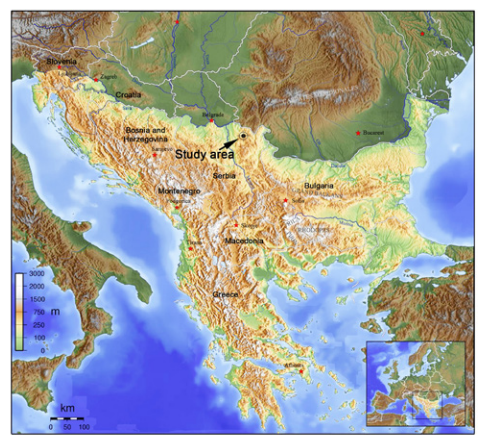
Figure 1. Map of Serbia showing the study area