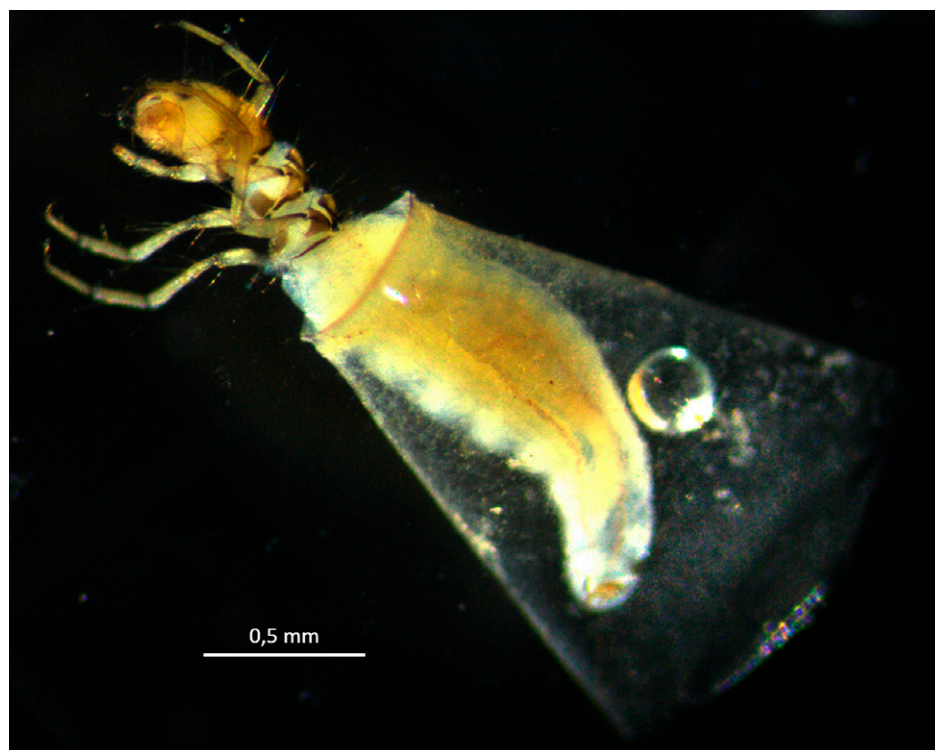
Fig. 2. Oxyethira sp. larva from the Indijski Potok Stream.

is still lacking (MARSHALL 1978, SALOKANNEL et al. 2012, WARINGER & GRAF 2011). Based on distribution and ecological preferences of the known species of this genus in Europe (GRAF et al. 2008), we could speculate that the found larval specimens probably belong to one of four widespread species (mentioned in the introduction). As O. falcata and O. frici are more common at higher altitudes (above 150 m a.s.l) and in colder waters, and as our collection site is at the lower altitude (slopes of Fruška Gora Mountain, 108 m a.s.l) with warmer water temperature (first author observation), these two species are unlikely candidates. Oxyethira flavicornis and O. simplex could be more suitable candidates, based on their ecological preferences.