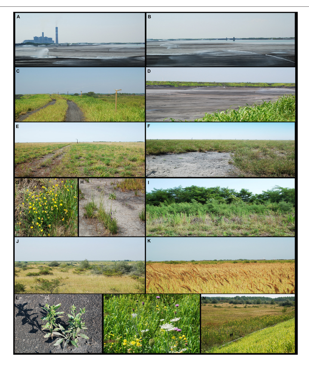
FIGURE 1 | Fly ash deposits at the thermoelectric plant station "Nikola Tesla-A" (TENT-A) in Obrenovac (Serbia): active cassette of fly ash (A-D) ; passive cassette of fly ash 3 years after biorecultivation with sown legumes, grassses, and shrubs (E-I) ; passive cassette of fly ash 11 years after biorecultivation with spontaneous colonizers (J-N) .

eriantha, Eragrostis sp., Hyparrhenia hirta, Lepidium bonariensis, Lespedeza cunea, Brachiaria serrata, Heteropogon contortus, Tristachya leucothrix, Setaria sphacelata (Morgenthal et al., 2001; Van Rensburg et al., 2003) (Table 2).