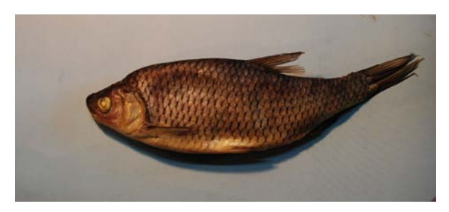
Fig. 2a. Specimen of roach ( Scardinius knezevici ) caught in 2011(Vlasina Lake reservoir).