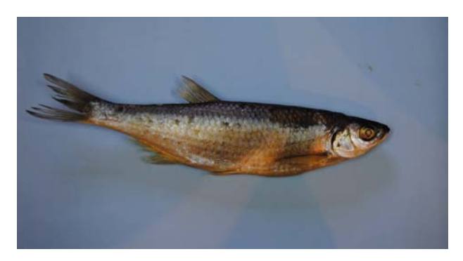
Fig. 3. Specimen of bleak ( Alburnus scoranza ) caught in 2003 (Vlasina Lake reservoir).

which originate from the Adriatic basin, has been clearly confirmed by the analysis of morphomeristic parameters, according to Kottelat and Freyhof (2007), in the form of naturalized populations Alburnus scoranza and Scardinius knezevici . On the other hand, the findings of the species Alburnus albidus , Rutilus basak (Adriatic basin) and Scardinius graecus and Pachychilon macedonicus (Aegean basin), described by Simonović and Nikolić (1997) and Simonović (2001), have not been confirmed in this research.