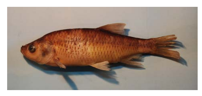
Fig. 2. Specimen of roach ( Scardinius knezevici ) caught in 2003 (Vlasina Lake reservoir).