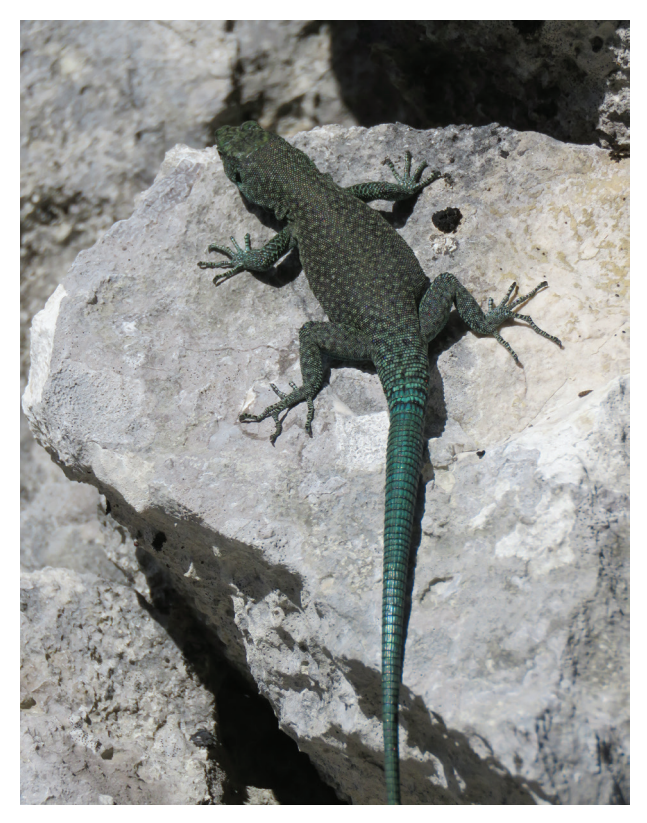
Figure 2. Sharp-snouted rock lizard ( Dalmatolacerta oxyceph-ala ) from the Komarnica canyon.

characterized this species as highly specialized regarding habitat choice (Bejaković et al. 1996b). This suggests a lower potential for survival in non-optimal environmental conditions.