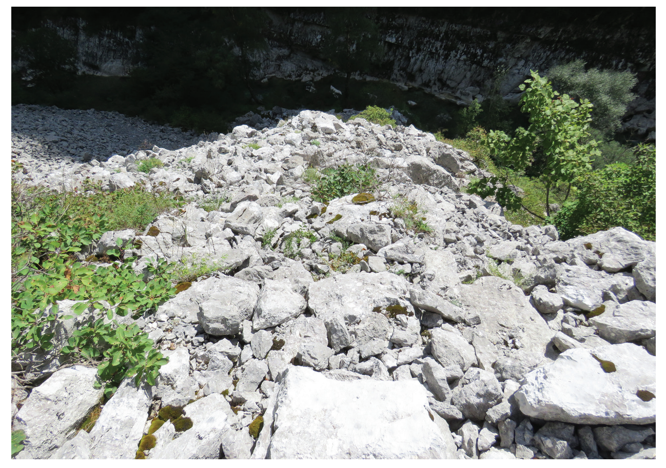
Figure 3. Microhabitat of the Sharp-snouted rock lizard ( Dalmatolacerta oxycephala ) in the middle part of the Komarnica canyon.

Ljubisavljević et al. (2018) mentioned that the rapid urbanization and the increase of touristic infrastructure is a general threat for local coastal populations of endemic lizard species in Montenegro, which includes D. oxycephala. We would add that there are similar challenges for the mainland populations of this species as well, particularly for refugial ones scattered in canyons, as it could be the case with this new recorded one in the mid-part of the Komarnica Canyon. An increase in anthropogenic activities that inevitably alter or destroy natural habitats in this part of the Eastern Mediterranean region would jeopardize the stability of local Sharp-snouted rock lizard populations, as well as other endemic, threatened, Natura 2000, or in some other aspect important wild species. According to Böhm et al. (2013), human-induced habitat loss is one of the predominant threats to reptiles, and the distribution and severity of those threats will shape the future fortune of reptiles. Careful and responsible planning of economic development in Northern Montenegro should support ecological tourism as an adequate solution for the increase of living standards, without harming the local wildlife populations by severe anthropogenic alterations of the landscape.