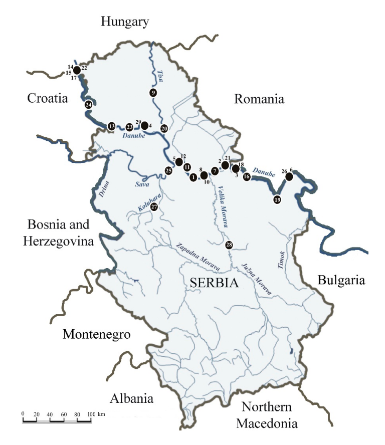
Figure 1. Locations of initial findings of allochthonous macroinvertebrate species along the rivers in Serbia. Numbers correspond to the species as listed in the Table 3.

The largest number of species, 18 (62.07%), originates from the Ponto-Caspian region, while Asia and North America are represented by 5 species each (17.24%). One recorded species (3.45%) is from the Western Pacific.