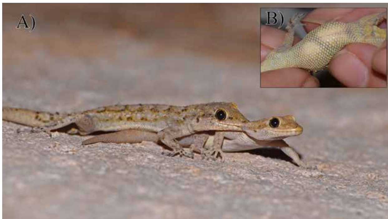
Fig. 3. Evidence of M. kotschy reproduction in the Niš population. A) Mating pair; B) Gravid female with visible eggs

relatively recent (15–20 years ago), simultaneous introduction into the large urban centres.