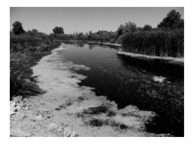
Figure 2: The Nadel Canal (Starčevo locality) – typical habitat of A. aquaticus in Serbia.

Although in investigated area other representatives of asellids, such is genus Proasellus , could be present, in this investigation their presence was not confirmed. Morphologically all found specimens were more or less uniform, and belong to type species A. aquaticus (Figure 3).