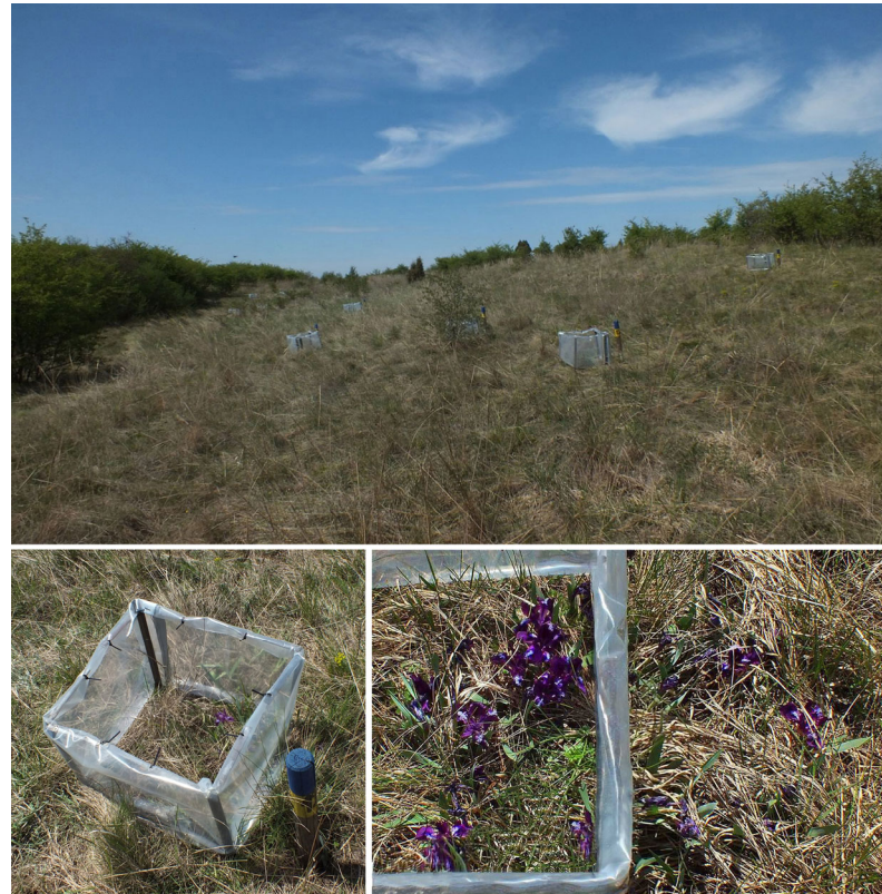
Figure 3. The open top chambers (OTCs) deployed on individual clones of Iris pumila naturally growing on a dune slope in the Deliblato Sands ( upper picture). Perspective and aerial views of the OTC positioned over I. pumila clone ( lower picture).

the intermixing with alien clones after the blooming phase, we removed all flowering ramets differing in coloration from the focal clone that were growing in its vicinity of 30 cm. In May 2017, after the flowering phase ended, we positioned the OTCs over one half of each selected clone, leaving the other half to experience natural environmental conditions (Figure 3).